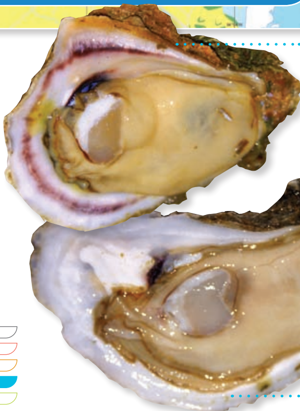
ELM GROVE (East Galveston Bay)