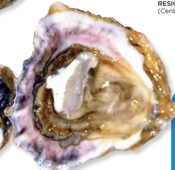
DRUM VILLAGE (East Galveston Bay)