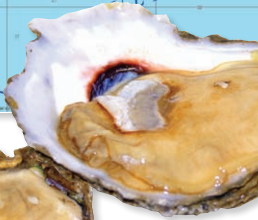
WHITE HEAD REEF (East Galveston Bay)