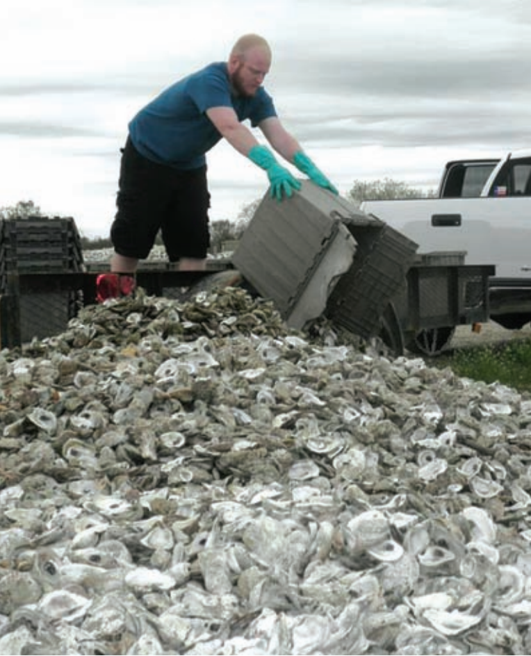
Tommy's Restaurant sells more than 10,000 oysters a week and recycles more than 110 tons of shells annually in Galveston Bay reefs, in cooperation with the Galveston Bay Foundation.