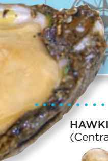
HAWKINS CAMP REEF (Central Galveston Bay)