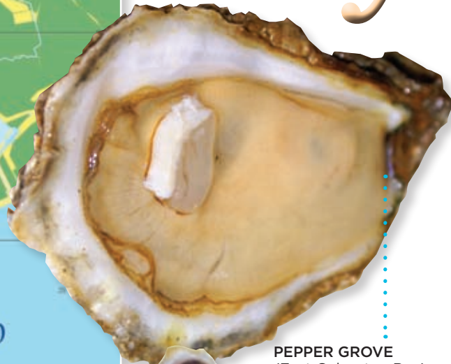
PEPPER GROVE (East Galveston Bay)