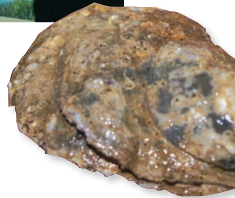
Commercially harvested oysters are usually around 3-years-old. Note the three rings on this shell, indicating approximately three years of growth.

at Jeri's Seafood, have joined together to help increase awareness—about oysters and about keeping Galveston Bay healthy. Each year they sponsor an Oyster Fest celebration, comparing oysters from 12 different reefs in Galveston. Those who attend can attest to the fact that, when served side by side, the differences in taste, shape, texture, and appearance are quite surprising. This includes shell shape, salinity, minerality; as well as the flavor you taste when you first place the oyster in your mouth (usually reflecting the salinity of the water around the reef); the flavor of the oyster itself when you chew it; and the aftertaste.