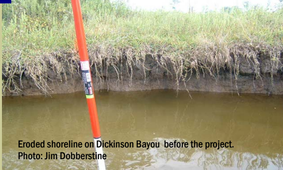
Eroded shoreline on Dickinson Bayou before the project.

A common concern of many landowners with shoreline property is erosion. A common response to erosion control is to install a bulkhead. Unfortunately, bulkheads can increase erosion on adjacent unprotected shorelines, are prone to structural failure over time, and cause loss of highly valuable fishery habitat. Living shorelines are attractive shoreline management options that provide erosion control benefits, while working with nature to enhance the existing natural shoreline habitat. Living shorelines often allow for natural coastal processes to remain through the strategic placement of plants, stone, sand fill and other structural and organic materials. These structures act as wavebreaks by reducing wave energy and erosion, supporting plant growth and marsh creation. Depending on the location of the property, the wavebreak itself can even become encrusted with oysters and other crustaceans, producing an artificial reef. In addition, living shorelines result in increased water quality and clarity for the landowner, the bay, and its fish!