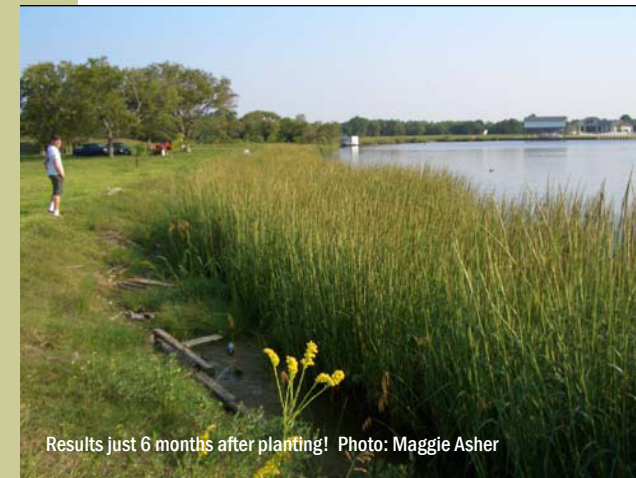
Results just 6 months after planting!

We can also help you identify whether grant funds may be available for your project, which could help make your project even more cost advantageous over a traditional bulkhead.