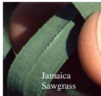
Jamaica Sawgrass