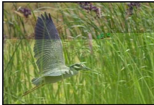
Yellow Crowned Night Heron, a native wetland bird Picture by Milt Gray, Wetland Restoration Team member