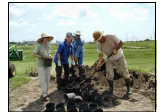
Master Naturalists volunteers assembling pots for future plant sprigs.

Park, Phase II and III. These volunteers have gained personal experience in the identification of wetlands and wetland vegetation. In addition, they have gained an understanding of the role wetlands play in providing habitat and improving water quality. Students as well as other volunteer organizations receive presentations about wetlands, wetland values, wetland restoration processes and local wetland restoration projects.