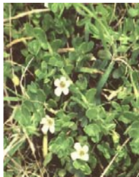
Coastal Water Hissop