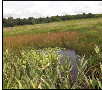
Sheldon Lake SP, Phase I wetlands

within the urban East End of Houston, and involves the creation of wetland habitat as part of a flood control project. This project demonstrates a positive and beneficial alternative to traditional flood control projects.