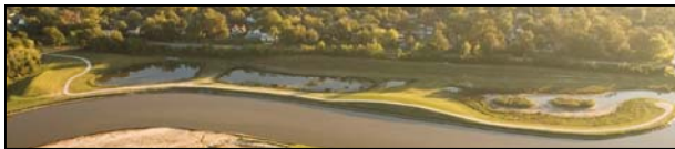
Aerial view of Mason Park created wetlands

Grant, has been actively involved in wetland restoration in Galveston Bay. TCWP, in partnership with state, federal and local agencies, has worked to establish freshwater wetlands in the Galveston Bay watershed. Our first major project includes the crea-