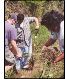
Austin High School students collecting maidencane, Panicum hemitomon

been the key force in the wetland restoration process, collecting plants from the four county region (Harris, Galveston, Brazoria and Chambers counties), and they assist in current restoration projects like Buffalo Bend Park and Sheldon Lake State