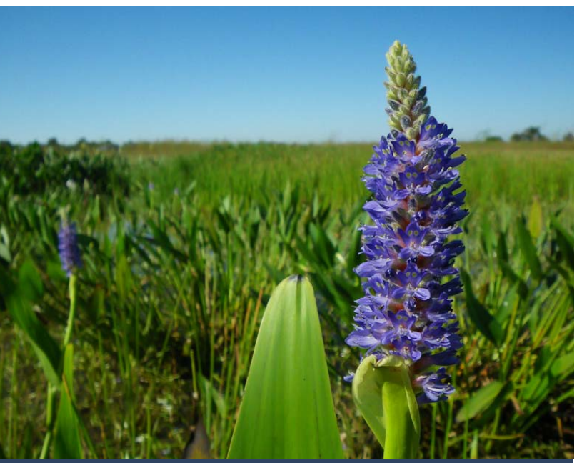
Pickerel Weed (Pontedaria cordata) is an excellent choice for establishment in the deeper sections of restored wetland basins.

the original plant community. Local native fauna, especially black-bellied whistling ducks, immediately congregate to the successfully restored wetland basins—completing the restoration cycle. The time needed to complete the restoration from plant collection to final establishment can stretch over several years.