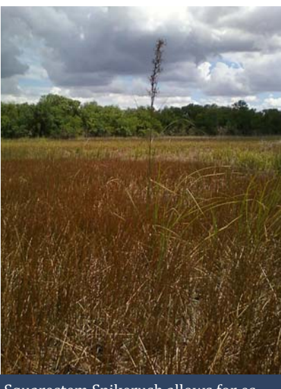
Squarestem Spikerush allows for establishment of other species like the Jamaica sawgrass in the foreground.

Establishing a plant cover as quickly as possible should be a primary goal in the restoration process. This establishment is the first line of defense against invasive plants which will multiply at higher rates. For example, cattails (Typha spp.) alone can produce an excess of 10,000 seeds per seedhead.