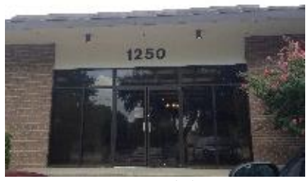
1250 Bay Area Blvd, Suite C Houston, Texas 77058

Our office is located on the right hand side of Bay Area Blvd at Royal Crest Drive (if you are coming from I-45). It is after the light on Diana Lane. If you reach the light at Saturn Lane, you have gone too far.